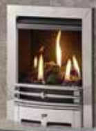
GAS FIRES & STOVES

VISIT OUR STUNNING TWO-STOREY SHOWROOM IN YEOVIL, SOMERSET