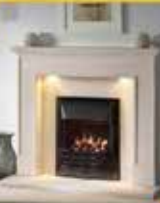
STONE & TIMBER MANTELPIECES