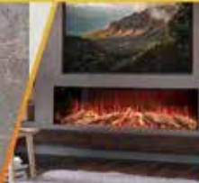
ELECTRIC FIRES & STOVES