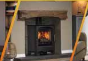
SOLID FUEL FIRES & STOVES