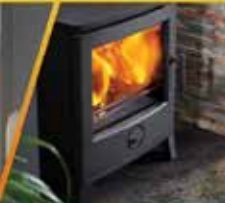
HEARTH, CHAMBERS & ACCESSORIES

A beautiful two-storey showroom featuring over 80 displays of Gas, Electric & Solid Fuel Fires . Along with a range of high-quality stone and timber mantelpieces, hearths, chamber linings and fireplace accessories .