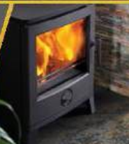
HEARTH, CHAMBERS & ACCESSORIES

A beautiful two-storey showroom featuring over 80 displays of Gas, Electric & Solid Fuel Fires . Along with a range of high-quality stone and timber mantelpieces, hearths, chamber linings and fireplace accessories .