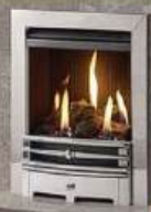
GAS FIRES & STOVES

VISIT OUR STUNNING TWO-STOREY SHOWROOM IN YEOVIL, SOMERSET