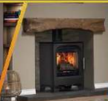
SOLID FUEL FIRES & STOVES