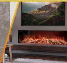
ELECTRIC FIRES & STOVES