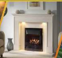
STONE & TIMBER MANTELPIECES